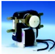
SM327 Includes brackets and fan blades