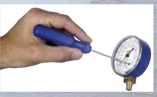
Zero point adjustment