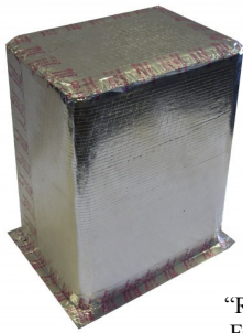
"RECTANGULAR" FOR BOOT CLIPS INSTALLATIONS