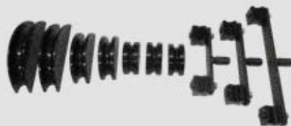
HY-TELL bending adapters