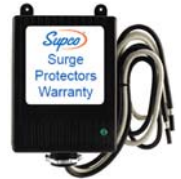
Surge Protector Warranty