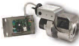
HSJ, 1,2 Include UC1 Control

Used for side wall venting natural gas, LP or oil fired equipment including: furnaces, boilers, water heaters and unit heaters. All models feature the UC1 Universal Control and a diaphragm Fan Proving Switch safety interlock. Damper allows adjustment for maximum combustion efficiency. Inputs up to 600,000 BTU/hr.