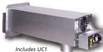
Includes UC1 Control

SS2 inputs up to 1.2 GPH; 150,000 gas SS1 inputs from 1 GPH to 1.6 GPH; 160,000 gas SS1C inputs up to 2.25 GPH