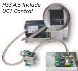
HS3,4,5 Include UC1 Control

Used for commercial applications to side wall or vertically vent natural gas or LP fired atmospheric or power burner equipment. All models feature the UC1 Universal Control and a diaphragm Fan Proving Switch safety interlock. Interlocks with any 24/115 VAC burner control circuit and also includes "dry" contact actuation option. Excellent for electric-to-gas conversions, renovations, new construction or for replacing deteriorated chimneys. Inputs from 450,000 to 1,825,000 BTU/hr.