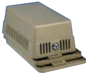
Universal Series BTG-U02