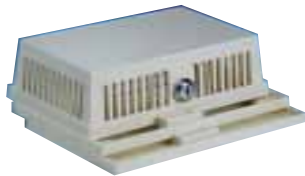
Designer Series BTG-DK