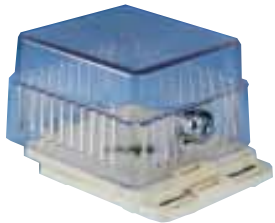
Elite Series BTG-EK