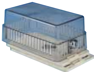
Regal Series BTG-RK