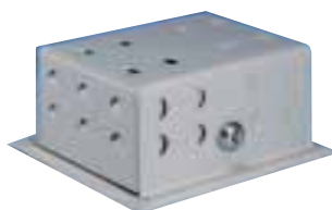
Sentinal Series BTG-54VL