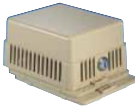
Classic Series BTG-O